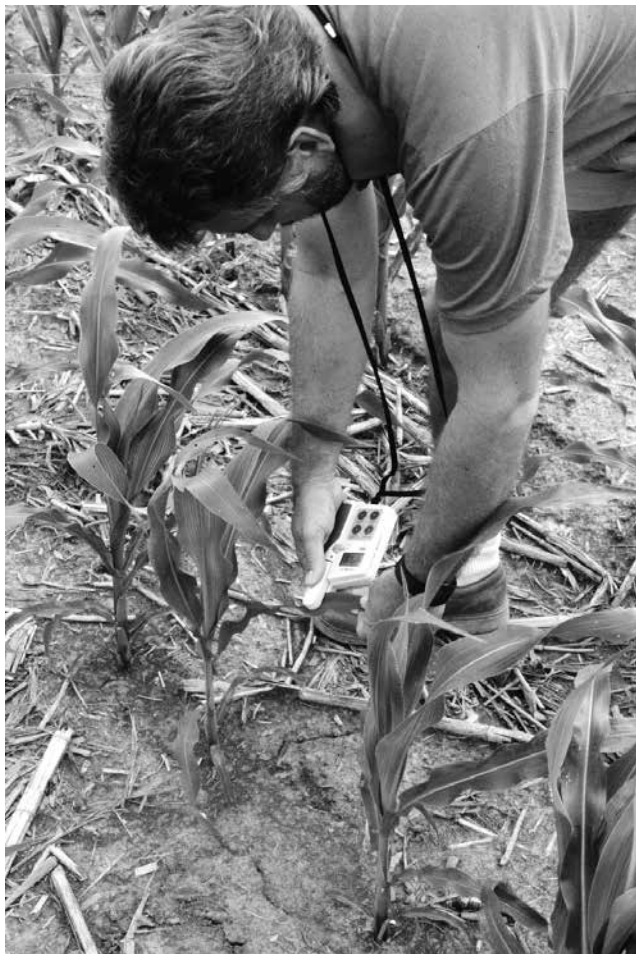
Figure 2. A chlorophyll meter in use.

CLEAR" button because this will remove all readings taken to that point. If you want to look over all your readings at any time, use the "DATA RECALL" button to scan the readings you have taken. Each time this button is pushed, the meter will cycle through the readings in the order they were taken. During the scan, you may use the delete button to remove a reading and then replace it by taking another reading.