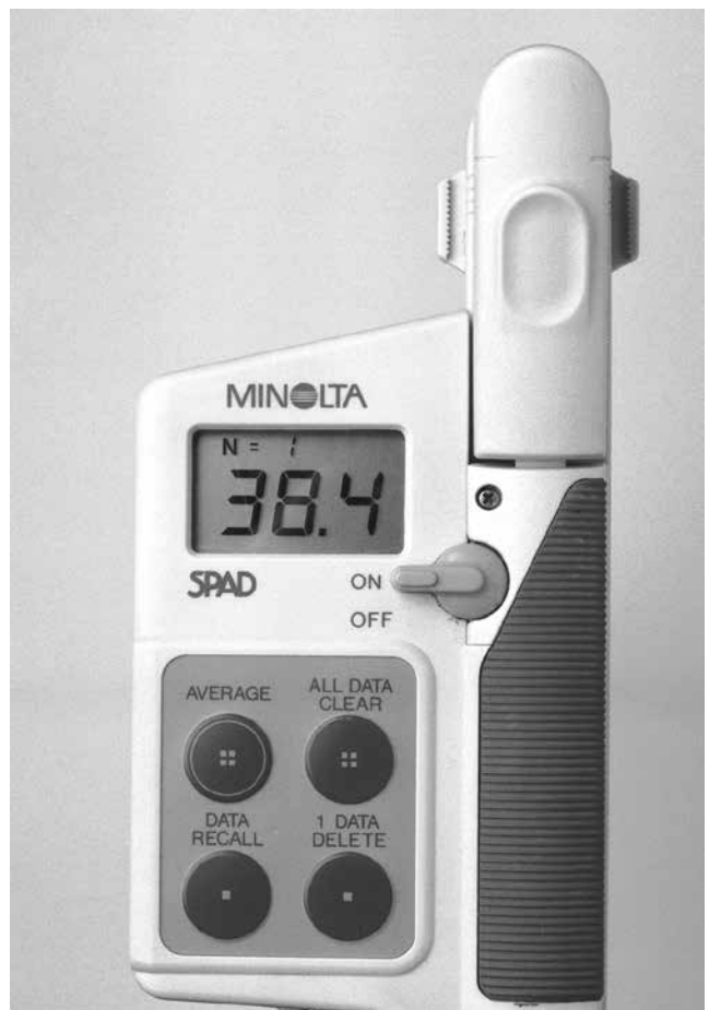
Figure 3. Picture of chlorophyll meter showing function buttons, display screen, and meter head.

Once the operator has become familiar with the meter operation and leaf stage identification, readings can be done very quickly. Since the meter will store up to 30 readings in memory and then calculate an average reading, at least 30 readings should be done. If a field is very variable, more readings may be necessary for an accurate field average or to determine if several different N rates would be appropriate for the field.